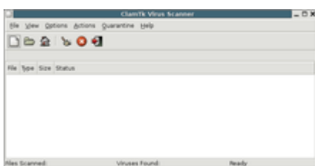
Early release of ClamTk from 2005

ClamTk was originally written using the Tk widget toolkit , for which it is named, but it was later re-written in Perl , using the GTK toolkit. The interface has evolved considerably over time and recent versions are quite different than early releases, adding features and changing the interface presentation. It is dual-licensed under the GNU General Public License version 1 or later, and the Artistic License . [2][6][7][8]